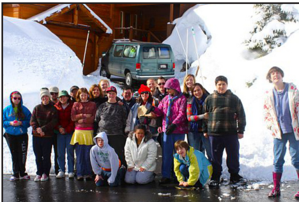
2011 YEAR-ROUND CAMPERS spend time playing in the snow in Truckee, CA.

Your access to all the happenings at Camping Unlimited.